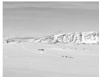
Kulusuk, East Greenland The dog sled from Kap Dan to the airport

www.GreenlandDirect.com www.IcelandAdventure.com 888 868-6784