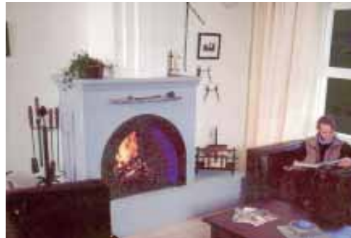
Relaxing After Riding at Hotel Eldhestar

www.horsesnorth.com www.icelandadventure.com 888 868-6784