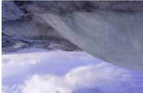
Ice Forms Russell Glacier, Greenland