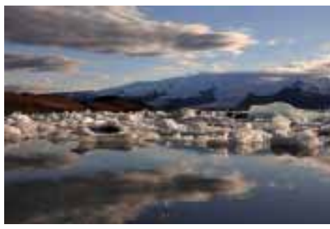
Icebergs in the glacial lagoon at Jokulsarlon, on the edge of the large glacier Vatnajokull.

horsesnorth.com icelandadventure.com 888 868-6784